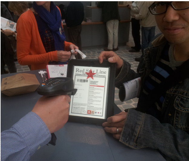
↑ E-ticketing at the Red Star Line Museum (Antwerp)