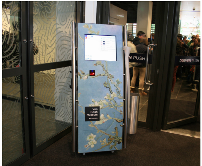
↑ Kiosk at the Van Gogh Museum (Amsterdam)