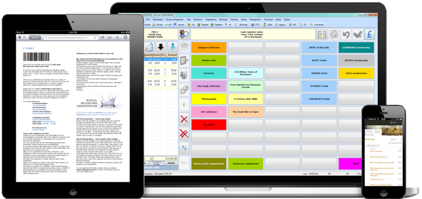
↑ Left: E-ticket Royal Museums Greenwich • Middle: POS software • Right: Online membership