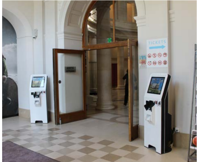
↑ Kiosks at the Royal Museum of Art and History (Brussels)