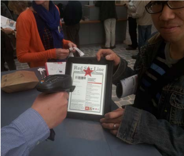
↑ E-ticketing at the Red Star Line Museum (Antwerp)