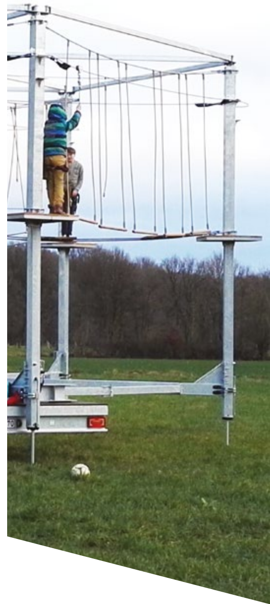
Winner of the SNEPA 2017 Product "Innovation Award"