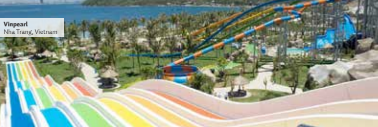
Vinpearl Nha Trang, Vietnam