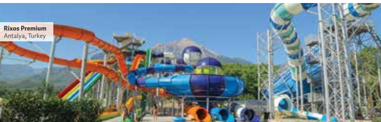
Rixos Premium Antalya, Turkey