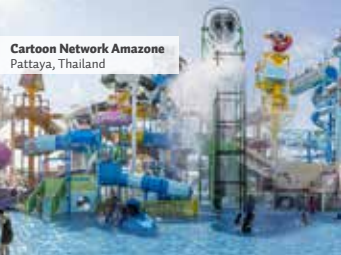
Cartoon Network Amazone Pattaya, Thailand