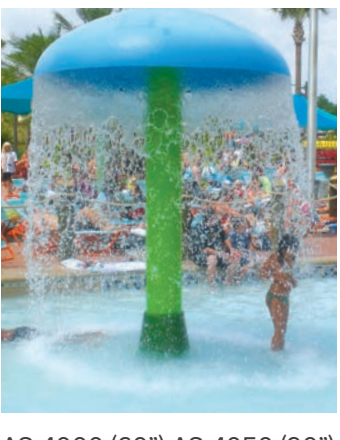
AS-4000 (60") AS-4050 (90")

Height 2.6m (8.5ft) 3.2m (10.5ft) Width 1.5m (5ft) 2.3 m (7.5 ft)