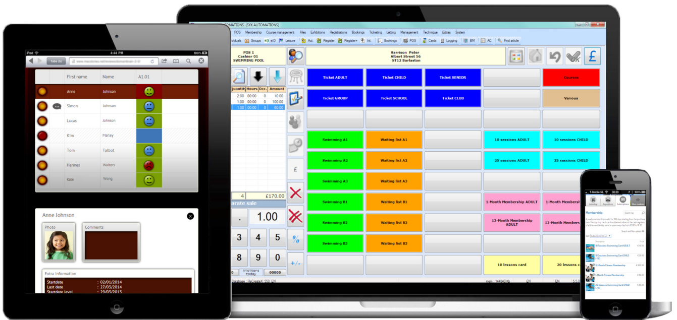
↑ Left: Course management • Middle: POS software • Right: Mobile membership