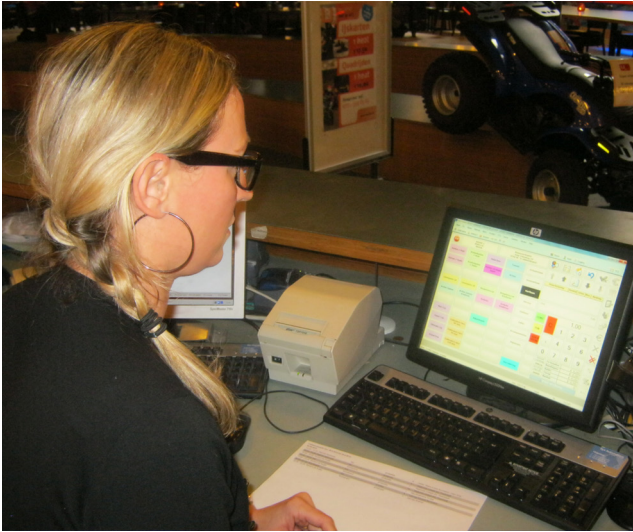
↑ At Leisure Centre De Uithof (the Netherlands)